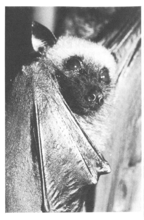
PTEROPUS SEYCHELLENSIS Above Wrong way up, but more appealing! Right Bat's way up