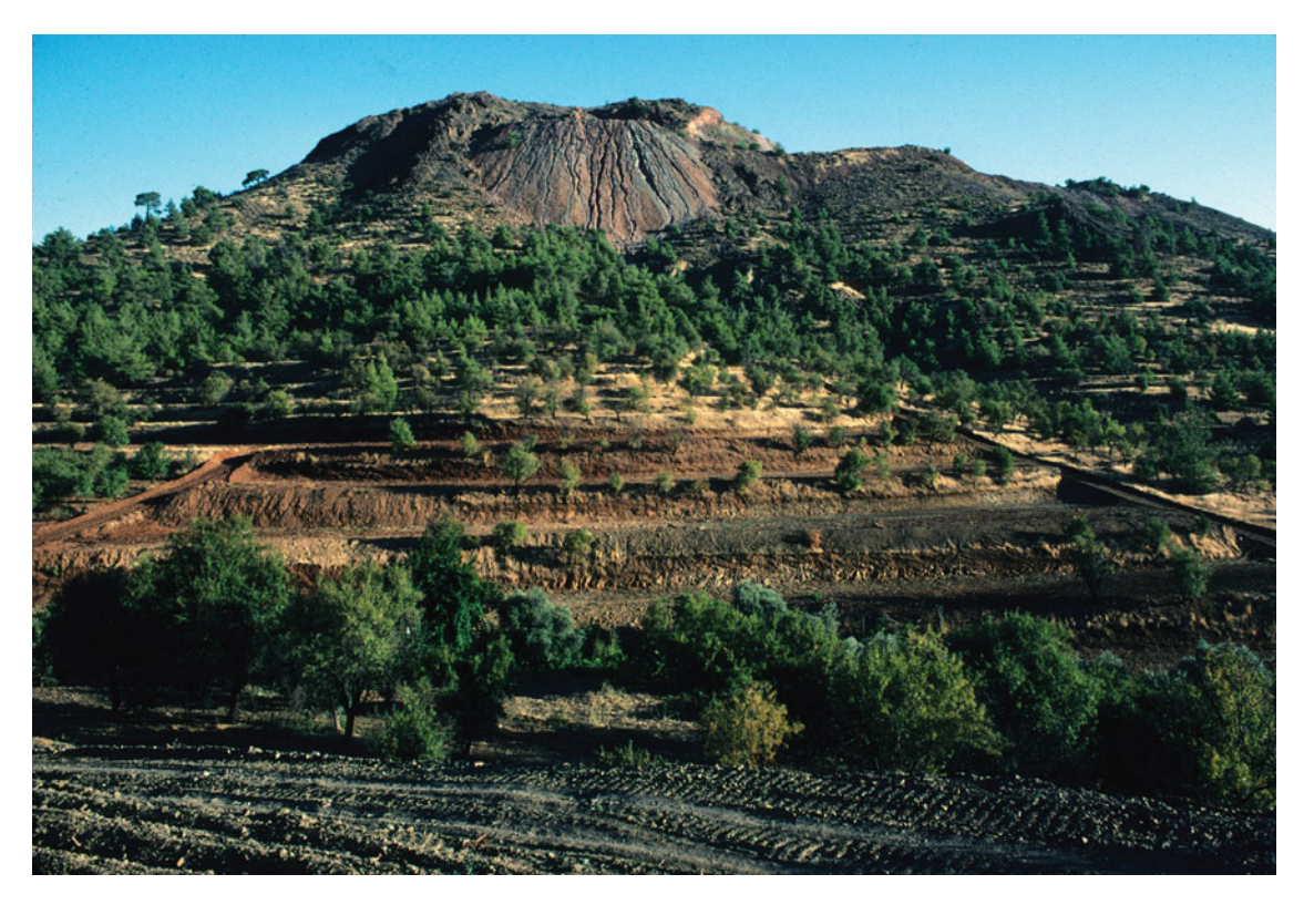
Figure 1. Alestos, Cyprus, showing (from top) spoil from twentieth-century copper mine, built terraces, bulldozed terraces and bulldozer tracks, July 2003.

clearly demonstrate agency (van der Veen 2014, 806– 9). Water brings its unique fluidity, its ability to transform to ice and steam, to connect and to hydrate living things (Strang 2014, 133–4). Wood, far from being a 'raw' material once cut off from the tree, still resists or aligns with the gestures of carpenter or basket-maker; sometimes, as with willow, it even continues to grow (Bunn 2014).