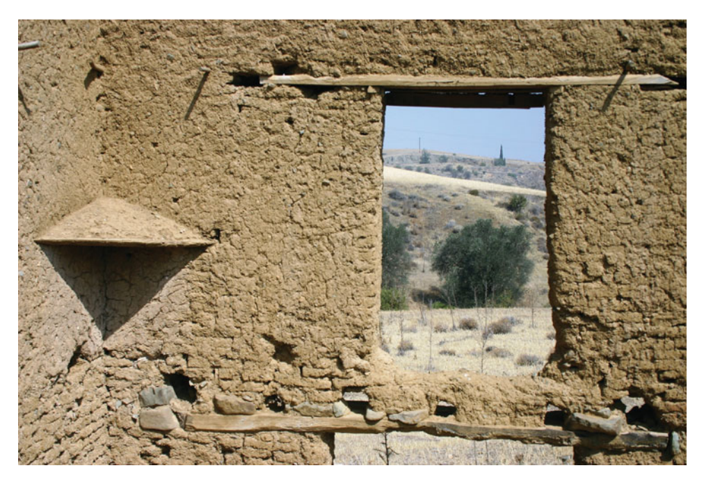
Figure 8. Mandres: interior of house looking northwest, with shelf made of threshing sledge plank (left), upper floor doorway, sockets for beams, mud bricks (below) and mud plaster (above), June 2016.

have separated slightly and become visible. In the west corner an old threshing sledge has been built in as a shelf, the original chipped stone blades still visible in its under surface; a triangular mound of melted mud brick and plaster covers its upper surface (Fig. 8, left). Looking northwest through the doorway, the old Pleistocene surfaces can be seen, heavily incised by streams coming off the Troodos Mountains immediately to the south (Given et al. 2013b, 26–7).