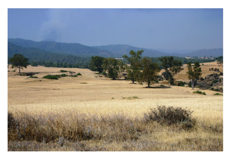
Figure 5. Mandres from the northeast, June 2016: mud-brick buildings behind the cluster of eucalypts, which mark threshing floors; Pleistocene terraces incised by gully; Troodos range with forest fire. Field in foreground: Quaternary alluvium, mainly silt; gravelly; 10YR 5/4. The fields between the foreground and the settlement have a 'manuring density' of 1–4 Medieval–Modern sherds per 10 sq. m, rising to 5–13 on the immediate outskirts of the settlement.

soil's time scale. So people cannot 'make' soil, but they can help it grow (Ingold & Hallam 2014).