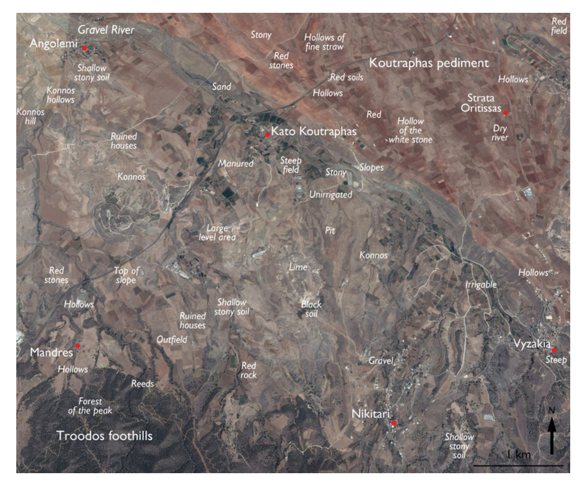
Figure 6. Koutraphas and Mandres area, showing villages and sites mentioned in the text (red dots) and soil-related locality names, based on the 1:5000 cadastral maps. Konnos = white clay for roofing. Translations by the author, with the help of Panaretos (1967, 99–106) and Yiangoullis (1992). (Map: Michael Given.)

2003, 193). They can be so successful that the sediment completely buries them, making them invisible on the surface and so hard to identify (Noller & Urwin 2013, 308).