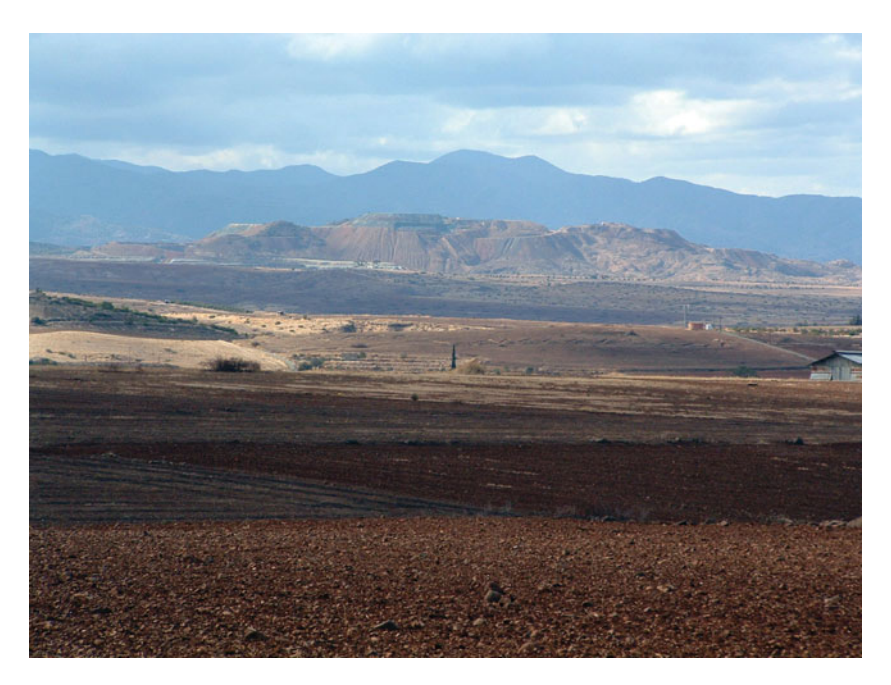
Figure 4. Looking west across the Koutraphas pediment to Skouriotissa copper mine and the western Troodos Mountains, November 2003. Foreground shows terra rossa (2.5YR 4/3) containing haematite clasts, pottery and lithics.

Tsing 2010, 201; Wylie 2007, 166–7). Like animism, it offers a 'respectful and attentive awareness' of the non-humans we share the world with, and on whose symbiosis we depend (Jones & Boivin 2010, 343).