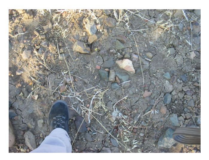
Figure 2. Surface of Survey Unit 2605 in July 2003: Quaternary gravelly colluvium, Roman self-slipped amphora toe, soil colour of 5Y 6/3, oats, cracks from drying, basalt chunks, team leader's boot, red body sherds.

philosopher: Fouke 2011, 148), sees 'a seething foundry in which matter and energy are in constant flux' (Hillel 2008, 1; Fig. 2). All of soil's properties, agency and power come not from an essential monolithic substance, but from the myriad partners that constitute it.