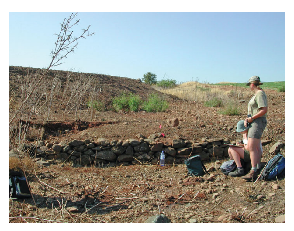
Figure 7. Check dam at Potami Strata Oritissas, trapping cobbly sediment in a shallow gully incised through Pleistocene pediment, July 2003. Soil colour 5YR 3/4.

back to the original date of the church, and today there is an icon of the Zoodhokhos Piyi , the Life-Giving Spring, showing water flowing out of a chalice holding Christ and the Virgin Mary. The spring feeds a cluster of tiny fields in the bottom of the bowl created by the landslide and then goes on to generate the soils, waters and agricultural produce of the stairway of check dams running down to the river at the base of the hill.