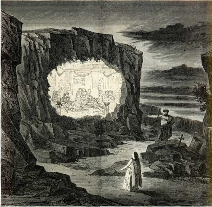
Fig. 1 The moment in Act II in which Satan shows Lilia, by means of a 'magical image', her beloved Hélios singing a love song to Olympia, whom the Romans have installed as queen over her native lands near the Euphrates River. Front-page illustration in L'Univers illustré, no. 45, 26 March 1859

Roman Forum, with its bas-relief of Roman soldiers carrying off the Temple's massive menorah and other sacred implements.) Hélios and Olympia are now a couple, and their union is celebrated by a second grand aria for her, this time in honour of the love-goddess Venus, and an extended ballet divertissement. Lilia appears and reminds Hélios of his vows to her and to God. Olympia confronts the Greek prince with a choice: he must agree to reign with her or else Lilia will be put to death. The Christian maiden boldly declares her allegiance to God – indeed, to the Trinity – in a canticle-like aria ('Je crois au Dieu que tout le Ciel révère') that would take on a life of its own, separate from the opera. 34