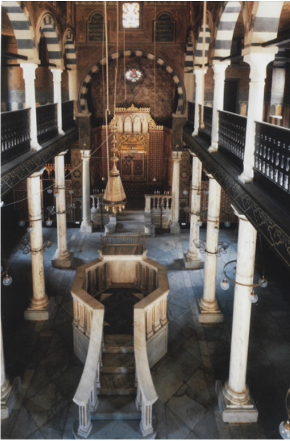
1.13. View of the interior from the upper gallery, Ben Ezra Synagogue, Cairo, Egypt.