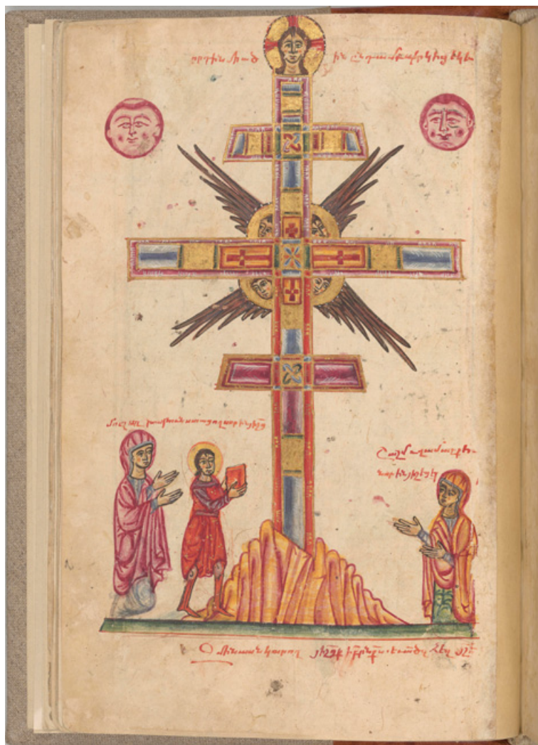
1.2. Embellished cross with donors, MS. M749, fol. 9 v. Gospel book; written and illuminated in Van, Armenia, in 1461.

these regions in the late antique or medieval period that does not take into account their presence and importance is incomplete and inadequate. In turn, and partly due to this rediscovery, Eastern Christian Studies – especially in the languages of Syriac, Coptic, Armenian (Fig. 1.2), and (Christian) Arabic – has experienced a renaissance and is entering something of a golden age, akin to the great flourishing it experienced in the late nineteenth and early twentieth centuries.