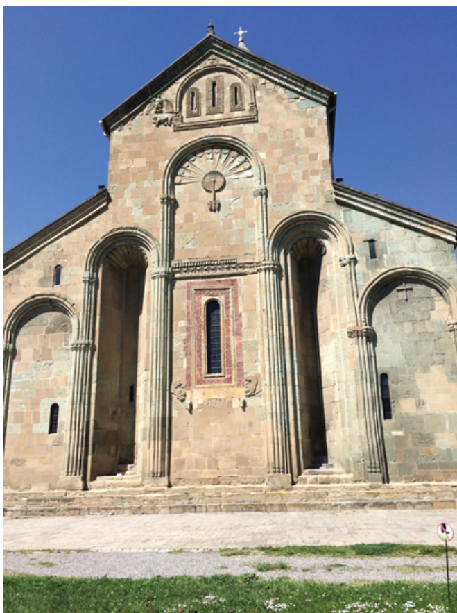
1.15. East facade, Svetitskhoveli Cathedral, Mtskheta, Georgia, eleventh century.

more firmly to its Near Eastern context. At the same time, the imprint of the Roman Empire on the Near East, even in memory, is indelible. Byzantine authority was linked to emperor and patriarch throughout, and we lose something if we ignore the role played by the Byzantine Empire and the Orthodox Church in Europe and the Near East alike. 59 That said, the notion of “Byzantium,” in its fullest sense, is a moving target. The Roman legacy is only one part of its role in shaping the Near East, both Christian and not. Highly diverse topics – yeshivot , Egyptian monasteries, liturgical objects, Jerusalem liturgy, Islamic origins – all fall under the purview of Byzantine Studies precisely because they depend, in part, on Byzantine categories for their existence and preservation and, crucially, for their study today.