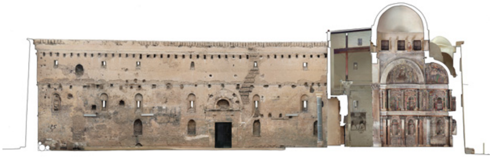
1.10. Red Monastery Church, section looking north, c. late fifth century. Laser scan drawing by Pietro Gasparri.