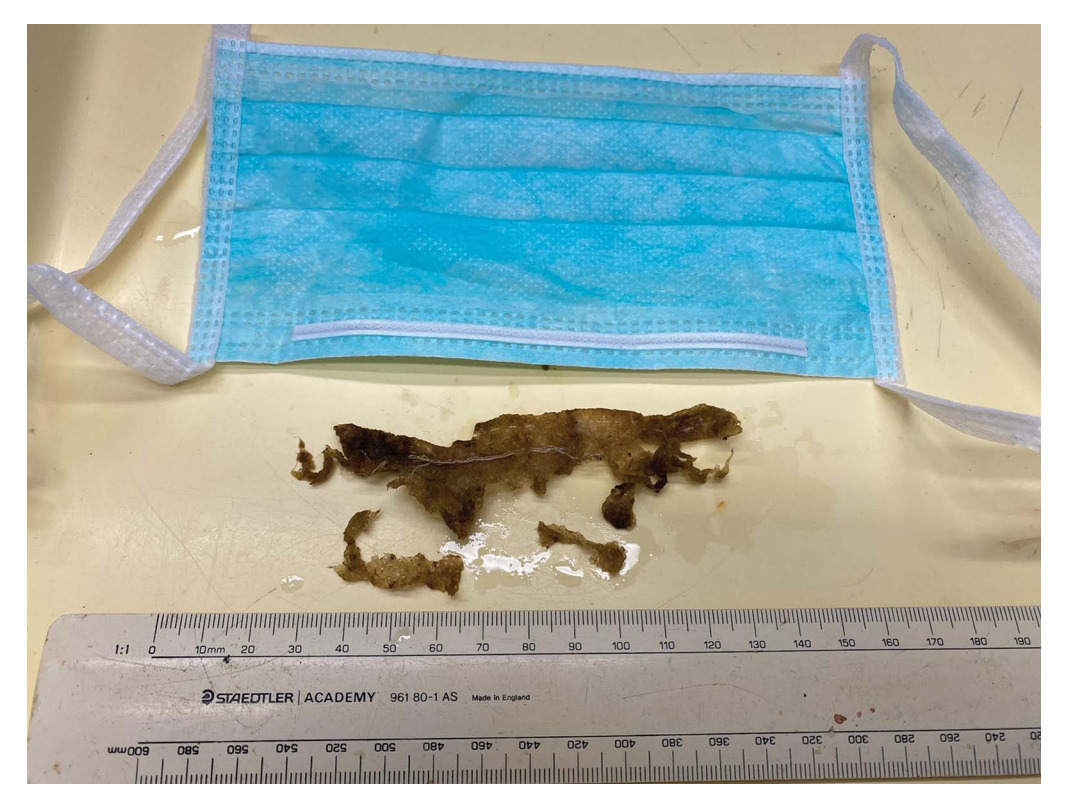
Figure 4. Among the artefacts found within the green sea turtle were the remains of a disposable facemask.

way. Encouraging the use of reusable PPE through incentives, for example, could easily reduce the number of facemasks in the environment (Figures 3–4). Future policies must also encourage governments, industry and communities to work together towards positive behavioural solutions (Vince & Hardesty 2018; Jia et al. 2019). As the case study above demonstrates, social media can be a powerful tool, as it has been shown to influence the political agenda (Barbera et al. 2019).