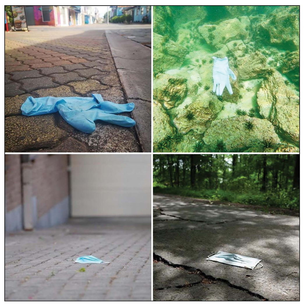
Figure 1. Discarded gloves in Galápagos (above) and discarded facemasks in Brussels (below).