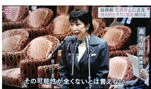
Takaichi Sanae on TBS, 8 February 2016