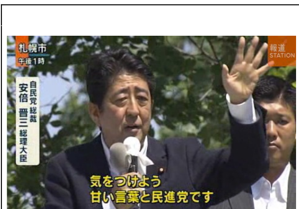
Abe Shinzō on Asahi TV, 8 July 2016

Following the passionate and well-attended protests against the Security Law in 2015, one might have expected greater levels of voter interest in the constitutional issue. However, Abe downplayed constitutional revision during the campaign, framing the election instead as a referendum on Abenomics, his program to revive the Japanese economy. Following Abe through a series of campaign speeches on the street ( gaitō enzetsu ), the Asahi News Network pointedly noted that the prime minister “ did not mention constitutional revision even once ,” instead criticizing the “irresponsibility” of the opposition parties and saying that he was only half-way through with Abenomics.