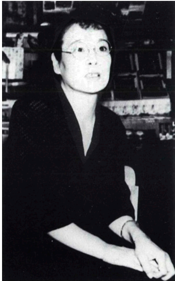
Ōta Yōko later photograph

These days one can observe a similar process when watching the consequences of the triple catastrophe of Fukushima. Life goes on, people start to forget, and the initial solidarity and engagement decrease, at the worst making way for the stigmatization of the victims, leading into a state of dissociation. The often-invoked Japanese stoic calmness in the face of catastrophes may be nothing other than a universal human reaction to trauma.