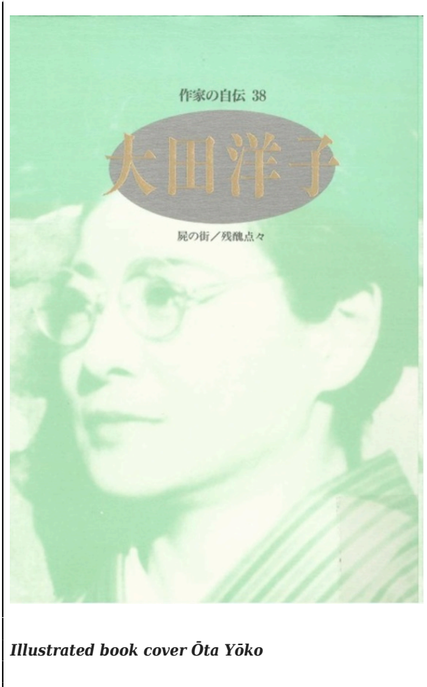
Illustrated book cover Ōta Yōko

Eventually there are non-witness authors who use Hiroshima as a historical background scenario or stage for their novels, such as Tsuji Hitonari's 辻仁成 (*1959) 2001 novel Taiyō machi 太陽待ち (Waiting for the sun). In Murakami Ryū's 村上龍 (*1952) SF-like Gofungo no sekai 五分後の世界 (The world five minutes after) of 1994, a world is delineated that could have been after Japan didn't surrender and the droppings of the bombs went on, until finally a big part of the population escapes the contaminated surface of the world and moves to the underground.