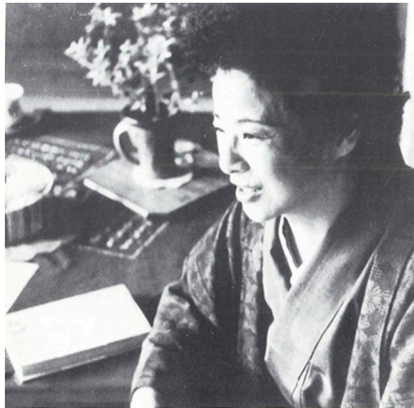
Ōta Yōko youthful portrait

account of it to those who come after them.