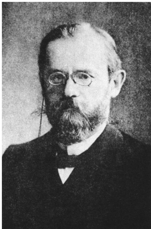
Figure 2. Hugo Winckler (1863–1913).