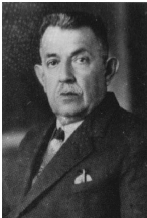
Figure 1. Théodore Macridy (1872–1940).

Empire, his curatorial work at the Ottoman Imperial Museum, and the foundation of the Benaki Museum in Athens at the end of a long career identify him as a 'liminal scientist' whose cosmopolitan identity led to his relative neglect in both Greek and Turkish national archaeology and museology (Thomassen, 2009; Beech, 2011).