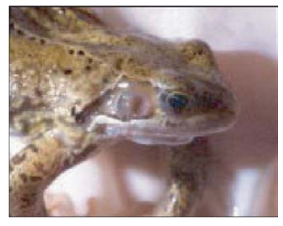
Fig. 1. Frog ref. 1080/96 with ulcerated right tympanic membrane 24 days post-exposure, via immersion, to homogenized tissues from frogs with ulcerative skin syndrome. This frog also developed ulceration of the left maxilla and left rostrum.

wounded skin, ranavirus was detected in the kidneys of five of six animals that developed systemic haemorrhages and in ulcerated skin from two (refs 1029/96 and 1066/96) of five frogs examined that developed this lesion. No mock-infected frogs were positive for ranavirus.