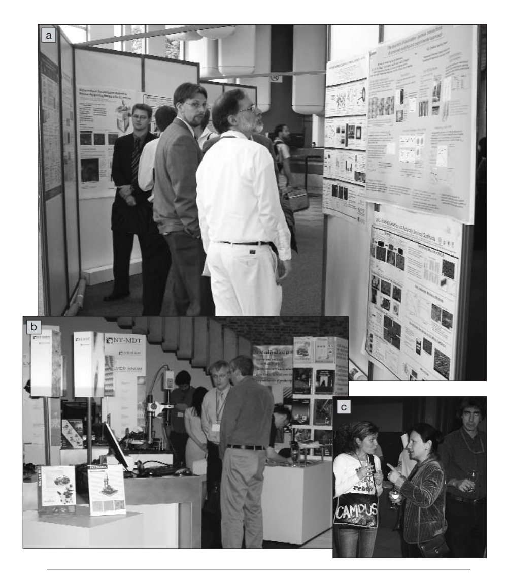
(a) Poster session and (b) equipment exhibition at the 2005 E-MRS Spring Meeting. (c) Meeting attendees converse with their colleagues.

hydroxide-based layers, and functionalized and biometric films. The scientific challenge of thin-film characterization was met with techniques such as ellipsometry, x-ray reflectivity, and scattering analysis.