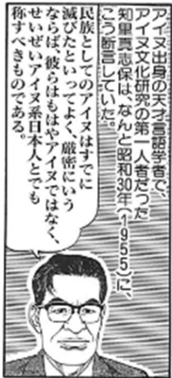
Figure 8: Chiri, the “genius linguist of Ainu origin” and the scholar at “the forefront of Ainu culture studies” claimed in 1955 that Ainu “as a people/ethnos ( minzoku ) can be...” (Source: Kobayashi Yoshinori, “Honke Gōmanism Sengen Dai-rokuwa: Ainu ‘Minzoku no Decchi-age’ wo Yurusuna!” [Original Haughtiness

We can say that in all sectors of life the ‘lifestyle of the Kotan (Ainu settlement)’ has completely died out. There are hardly any people who can disseminate and pass on the old language or tales and stories. Among men over fifty years old this is particularly the case, let alone both men and women under forty. Even those few elder women who have survived, today they are completely Japanified ( nihon-ka ) and among them there are women in their seventies who use abacus to calculate, keep account books, and others who have modernized to the extent that they are called by modern nicknames. There is even one woman who can read and write English. There are also women who read the newspaper every day without fail and debate about the vote for women. Surely this is a degree of assimilation that naichijin [those living in Japan proper as opposed to the “colonies”] couldn’t even begin to imagine. 26