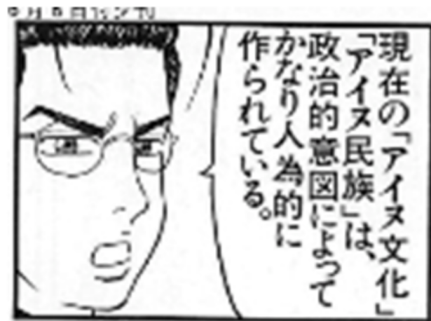
Figure 4: In his first outing into Ainu historiographic territory, Kobayashi's inked-self claims, "Today's 'Ainu culture' and the 'Ainu People' are, to a great extent, fabricated according to political motives" (Source: Kobayashi Yoshinori, "Gōmanism Sengen extra: Nihon Kokumin

country, which can no longer enact its sovereignty in the same manner as before, through attempting to ensure that broken public commitments are re-promised. Overflowing with a spirit of revenge, they embrace this kind of empty hope and idealism – making the now familiar cry that Japanese "society must be defended." Even if they do not embrace such high-minded idealism, unless they believe the major premise that "Japan" is somehow a "good country," they somehow cannot imagine it even possible to proceed forward. They cannot rest unless they rebuild this sacred canopy "Japan" and defend it from everything and everyone that would have it fall apart. They do indeed wish to postpone living in the present so that they can give themselves up to the future of the country, even if this is ultimately an un-demanded and now nigh impossible task. In short, they are the typical modern vagabonds who embrace the kind of hope that Nietzsche abhorred as the basis for their deepest desires; the kind of "hope [that] is the worst of all evils, because it prolongs man's torments." 12