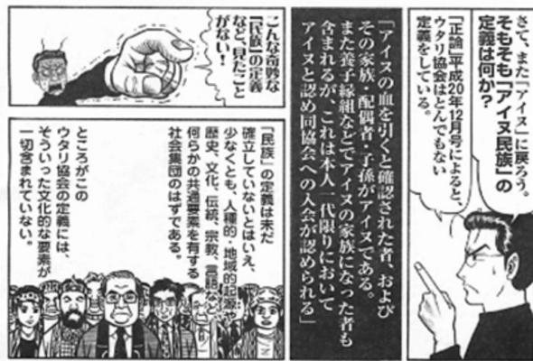
Figure 1: One example of Kobayashi's contradictions of logic. Here Kobayashi's alter-ego wonders what the definition of the "Ainu People" ( Ainu minzoku ) is and quotes a version of the criteria for membership of the Ainu Association of Hokkaidō; criteria which had family connections (including adopted offspring) at center. He asserts that while the definition (?) of a minzoku (people/ethnos) is yet to be established, the Ainu Association fails to focus on the kind of "cultural elements" that seem to be widely agreed upon as minzoku criteria (Source: Kobayashi Yoshinori, "Gekiron-ban Gōmanism Sengen: Okinawa to Ainu, 'Dōka' wo dō kangaeru ka?," Nishimura Kōsuke ed., Gekiron Mook: Okinawa to Ainu no Shinjitsu , Tokyo: ōkura Shuppan, 2009, p. 19).