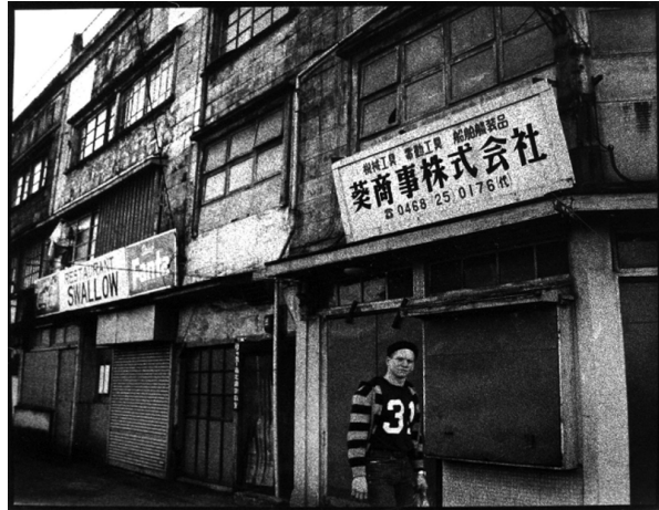
From Yokosuka Story, 1979

Ironically, I was also subliminally aware throughout my childhood that I was physically safer as an American child than any Japanese adult. As teenagers, my American friends and I used to hitchhike hundreds of kilometers every summer, confident that no Japanese would ever harm us. It wasn't until I interviewed Ishiuchi Miyako, the renowned Japanese photographer I feature in ANPO: Art X War , in early 2008, that I finally understood why. I was interviewing her for an American photo book showcasing her black and white photographs of Yokosuka.