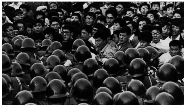
From Days of Rage and Grief