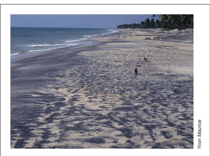
Mineral-rich "black sands" in Kollam, a coastal district in the Indian state of Kerala. These sands are a valuable source of monazite.

The Japanese firm Toyota Tsusho has entered into an agreement with IREL to set up a plant at Visakhapatnam in Eastern India to produce rare-earth oxides, and the company expects an export of about 4000 tons of the material from this