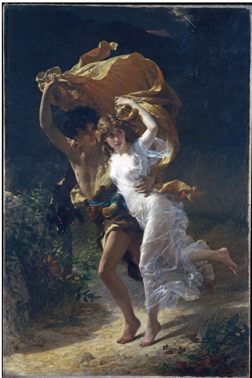
Figure 4.1 Pierre-Auguste Cot, The Storm (1880).