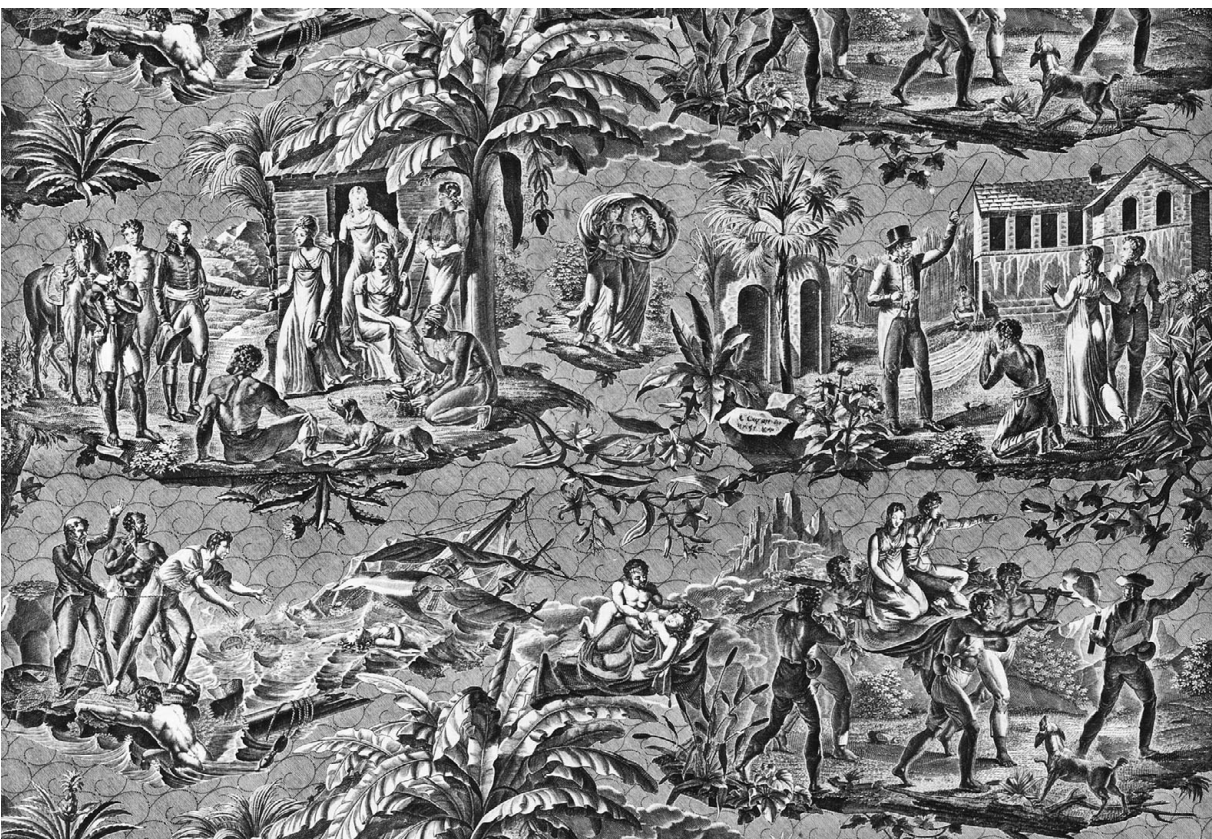
Figure 4.2 Scenes from Paul et Virginie , after Charles Chasselat and Antoine Johannot (1825–1830).