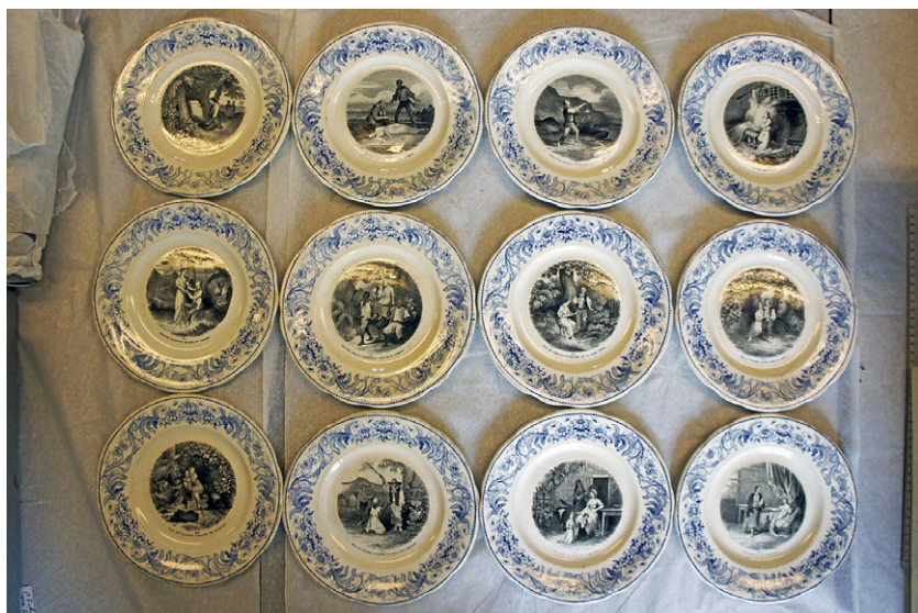
Figure 4.4 Anon., set of twelve plates with scenes from Paul et Virginie (1849–1867). Manufactured by Creil et Montereau (Oise, Seine-et-Marne). Number 1 is in the lower-right-hand corner of the bottom row; number 12 is in the far left of the top row. 128

glitters in sunshine, but also presage the glossy pink taffeta Virginie will wear upon departure to France. Held in the Old Man's arms, the infant Virginie performs her own curving wave, which prefigures her death by drowning. 129 This image conservatively undermines the matriarchal structure by offering a patriarchal fantasy of the nuclear family, with the Old Man here posing as a father-substitute taking possession of the infant, while Marguerite is relegated to the background, crowded between Madame and the sumptuous drapery, figured not as partner but as servant. Although most apparent in the series' first plate, this typological symbolism of her death appears throughout the sequence in wave and water motifs. For example, in Virginie Found after Her Death (Figure 4.4, plate 11), she has become a wave, lying on her side on the sand, facing us, one