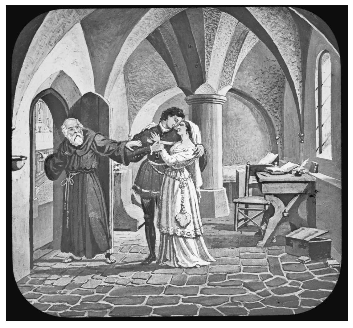
45. Briggs's 1908 Romeo and Juliet. Friar Laurence's Cell. Collodion on glass. 3.25 × 4 in.

clearly from the night-time pale blues, pale greens and silvers of the rest of the image. Given Juliet's classical poise and Romeo's distance, the deeply coloured, haphazardly draped cloth invitingly suggests the potential for a passionate intensity that might otherwise be thought beyond the emotional range of these central figures. It is, in fact, a balcony scene of careful spatial choreography but of only symbolically displaced passion.