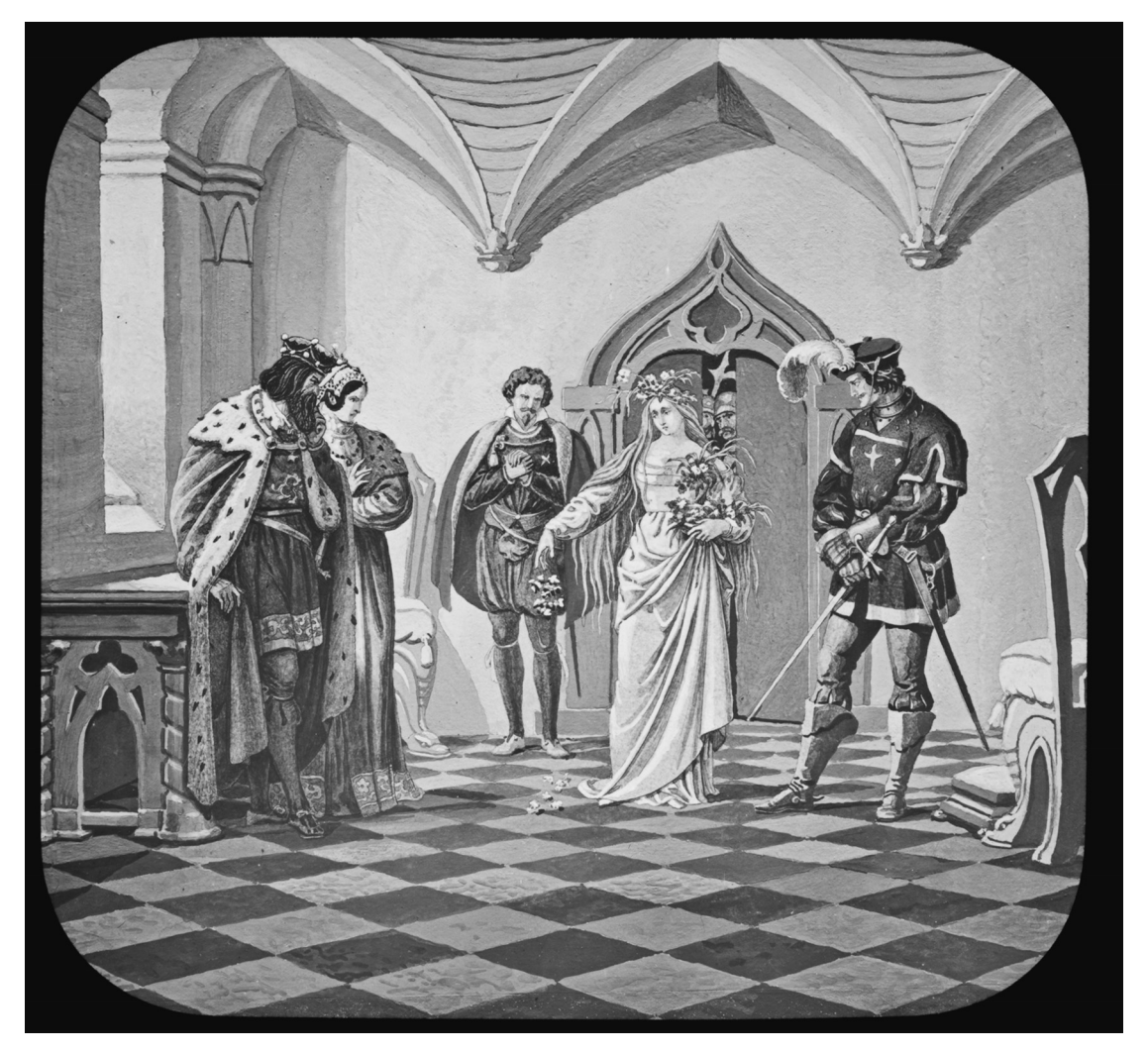
42. Briggs's 'Shakespeare Illustrated' Hamlet. Title on slide: 'Act IV, Scene 5 - Ophelia scattering flowers'.

Distinguished clearly from this dominant storytelling mode, however, is the slide entitled 'Ophelia' (Illustration 43). Rather than having been specifically drawn by one of Briggs's slide artists for inclusion in this set, it is, by contrast, a reproduction of English painter Arthur Hughes's 1852 painting Ophelia – copied onto glass directly from a photographic plate taken of the Art Journal 's printed lithograph.<sup>35</sup> Unsurprisingly, given its provenance, the image differs decisively in style and treatment from all others included in the sequence. It is