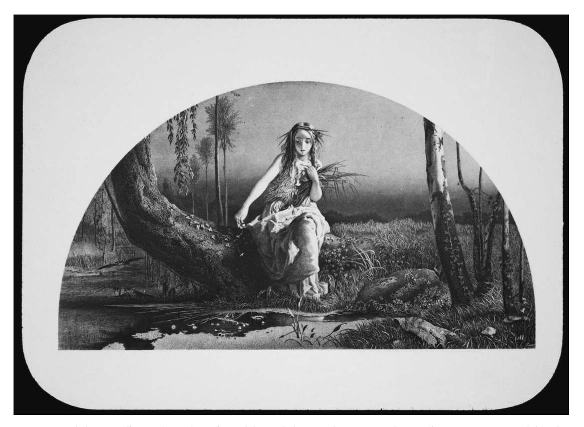
43. Briggs's 'Shakespeare Illustrated' Hamlet. Title on slide: 'Ophelia – Hughes'. From Arthur Hughes's 1852 painting Ophelia. This slide shows an Ophelia markedly different in style, presentation and associations from the Ophelia who appears elsewhere in the sequence.

conspicuously spare on narrative detail but rich in unexpected associations, technical acumen and significant whimsical charm. The Ophelia it presents is one who, unlike her more prosaic counterpart in the preceding slide (Illustration 42), for example, is appealingly suggestive of multiple other presences. Elaine Showalter has described the painting as showing: