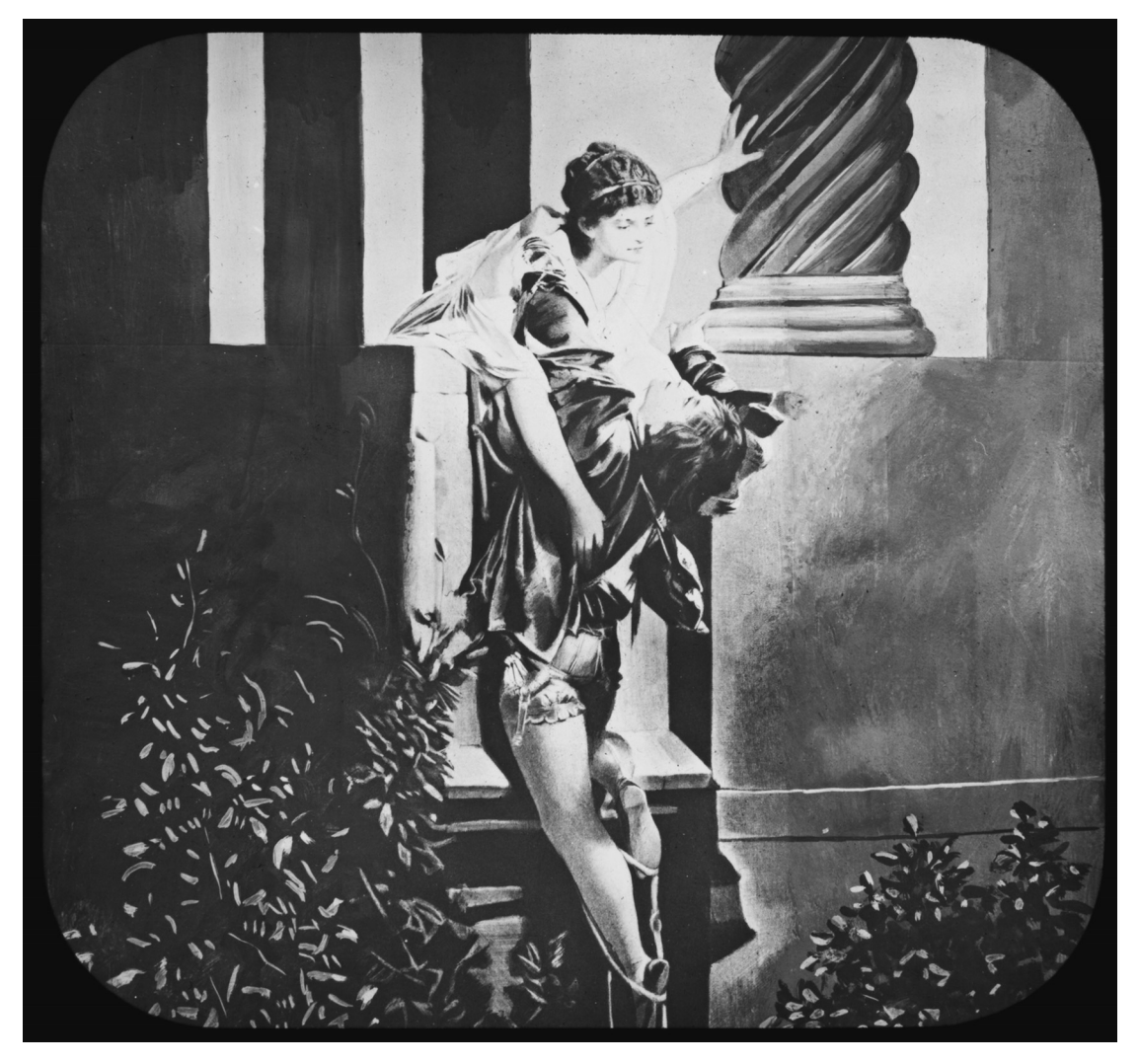
46. Title on slide frame: 'Romeo At Balcony - Makart'. Series Title: 'Shakespeare Illustrated'. Collodion on glass. 3.25 × 4 in.

bedroom in Warner Brothers' Adventures of Robin Hood (Michael Curtiz, 1938), nor of any of the later agile filmic Romeos adept at displaying their effortless manhood on ivy-clad walls. Rather, this Romeo's arched back, thrown back head, balletically languid legs and evident need of physical assistance patently feminize him. Correspondingly, though her own feminine grace is not thereby compromised, Juliet's physical poise and solicitous care for the physical welfare of her lover seem to