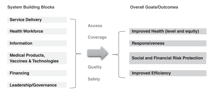
Figure 13.1 The WHO health system framework.