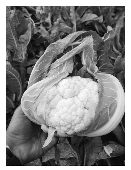
Figure 13.2 Cauliflower from the Mazovian region.