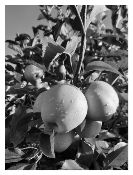
Figure 13.1 Apple orchard in the Mazovian region.