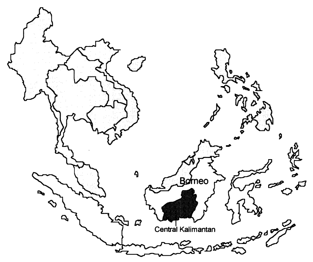
Figure 1. Location of Borneo and Central Kalimantan Province, Indonesia in South-East Asia.

detached from the questionnaire and saved by the respondent. Respondents could fill out the form while we were present or return it by post. The questions were multiple choice: