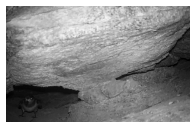
Hornby's storm petrel Oceanodroma hornbyi captured by a camera trap.

The only known colony of Hornby's storm petrel is in Pampa de Indio Muerto in the Atacama Desert, Chile,