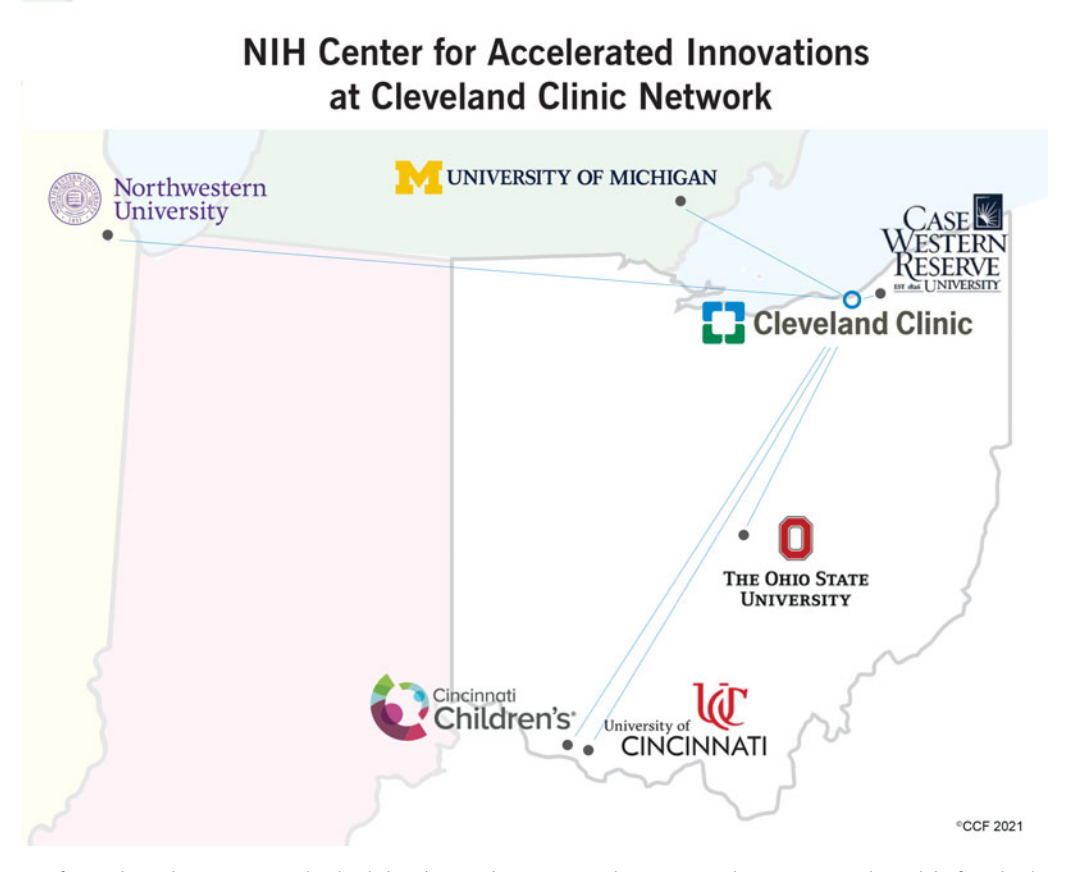
Fig. 1. Map of NIH Center for Accelerated Innovations at Cleveland Clinic (NCAI-CC) partners in Midwest. Inaugural consortium was limited the five Ohio-based institutions. Once the systems were in place, the program was scaled to include University of Michigan and Northwestern.

on closely aligned cardiovascular, lung, and blood clinical areas. As such it provided an attractive fit and opportunity for expansion.