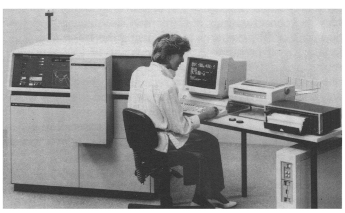
Outstanding performance and extreme ease of operation make the Philips PW 1800 automated X-ray powder diffractometer system ideal for routine analysis in industry and research.

The complete system is factory aligned and fully tested before delivery, for easy installation and assured stability.