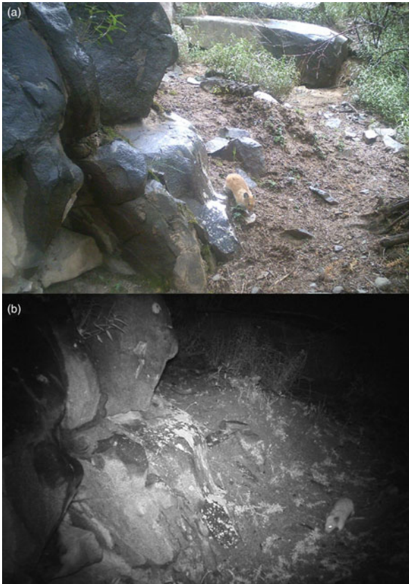
PLATE 1 (a) A photograph of Ochotona argentata taken on 24 July 2020 at 16.16, 43.8 km from the previously known range of the species. The pika was observed entering the interior of the rock formation in the bottom-left corner of the image. (b) A photograph from the same location as (a) on 13 August 2020 at 03.34. This constitutes the first evidence of nocturnal activity by this species.

behavioural ecology of this species and how it might respond to climate change, especially given its fragmented population and likely poor dispersal ability.