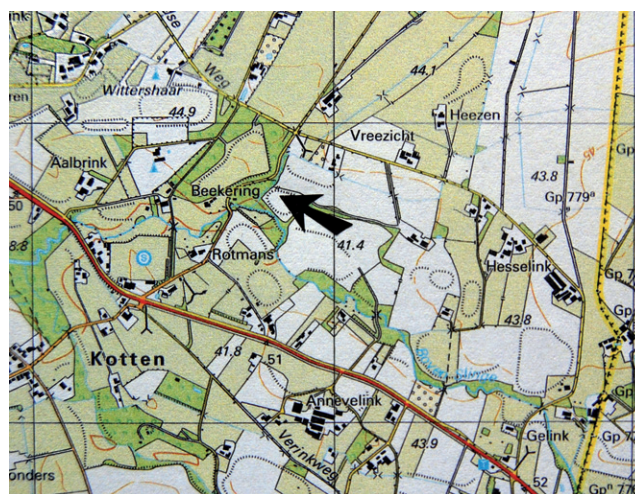
Fig. 1. Map of Kotten, east of Winterswijk, with arrow marking the position of the dump which yielded the echinoid specimen described herein.

depth indication is lacking. The whitish internal mould allows the original matrix to be determined as a fairly indurated, greenish grey, poorly glauconitic marlstone. As such, this might correspond to what Witte et al. (1992, p. 37) referred to as the 'onderste Flammenmergel', of late Albian age, but we cannot confirm this beyond doubt.