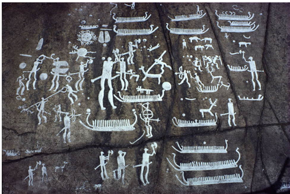
Figure 1. The Fossum panel in Tanum, northern Bohuslän, displaying numerous weapons and hunting equipment typical for southern Scandinavian rock art, including swords hanging from the waistline, axes held upright, spears used in hunting, and bows ready to shoot; in the centre, a circular image on the torso of a human may represent a shield.

combat and warfare (Kristiansen, 2002; Horn, 2013; Horn & Karck, 2019). In Scandinavia, swords are occasionally recovered in hoards, but typically they are found in graves, usually placed close to the inhumed body (Boye, 1896). In rock art, the swords' frequent attachment to humans points to a special significance, while their pragmatic purpose as weapons is rarely shown.