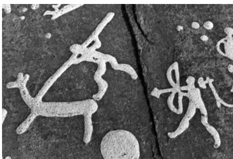
Figure 3. Hunting scene with spear held diagonally (pose B). Example of contact between the tip of the spear and an animal (X2), Tanum RAA 255:1, Bohuslän, Sweden.

the spear and its target, i.e. the spear is either in contact with or even pierces a target, which may be another human (X1) or an animal (X2). Alternatively, a human or an animal is held ‘at gunpoint’, with a distance between spear tip and target (X3 and X4 respectively). Holding a spear in attack or gunpoint positions threatens an opponent or prey, and it contextualizes these images into a fighting or hunting situation.