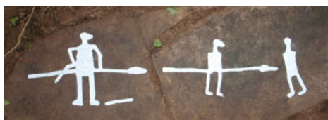
Figure 4. Combat scene with spears held horizontally by downward stretched hands (pose C). Examples of ‘gunpoint’ position without contact (X3), Bro RAA 33:2, Bohuslän, Sweden.

In cases where targets are missing and there are no indexical relationships (rows 15–17) we must rely on iconicity and may conclude that these spear usages cannot be given a precise meaning. However, people creating and comprehending images of humans holding spears without a target must have been aware also of instances in which people were pointing their spears towards other humans or animals, i.e. they had knowledge of such indexical relationships. Here we note that the different ways of holding spears are evenly distributed, without clusters in specific regions (see Supplementary Material, Appendix 1). When considering these spear configurations (rows 15–17), it is difficult to isolate iconicity from indexicality. Indexical relationships between the spear