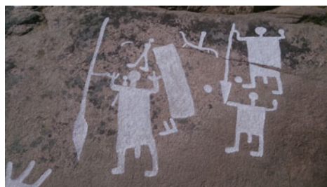
Figure 6. Spear held vertically (pose E). To the right, example of contact (X1), Tanum 460:2, Bohuslän.

Several questions arise in terms of the interpretation of scenes in which spears are used. Are they intended to be descriptive or normative? In the former case, they may be rendering actual, historical combat or hunting scenes. Or they may represent real but generalized events, i.e. ‘this is how combat or hunting activities typically take place’. In the latter case, they show prescriptive or idealized events, i.e. ‘this is how combat or hunting scenes ideally ought to take place’. But it is also often far from obvious that it is combat or hunting scenes that is being displayed, whether real or idealized. Possibly, ritualized events, such as ceremonial dances incorporating the use of spears, which in turn refer to spear uses in real situations, are depicted; in that case, they would act more as ‘images of (performative) images’ (see also Maddox, 2020).