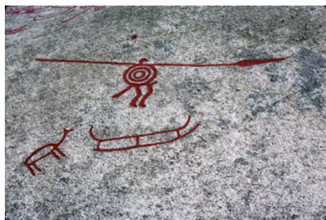
Figure 5. A spear placed horizontally on the shoulder and kept in place without visible hands (pose D). Example of passive spear use without an obvious target (Y5), Tanum RAA 12:1, Bohuslän.

spears demonstrates that these were used for fighting; the spears were probably also used for hunting.