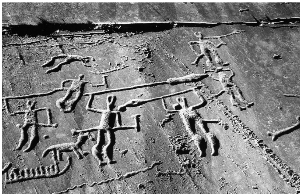
Figure 2. Example of a combat scene depicting humans with spears held above the head, Tanum RAA 192, Bohuslän.

and hence is a ‘mini-narrative’, but perhaps more so regarding spear use, due to their enhanced indexical properties as ‘pointy weapons’ and clearly indicated states of transition (in Genette’s terms).