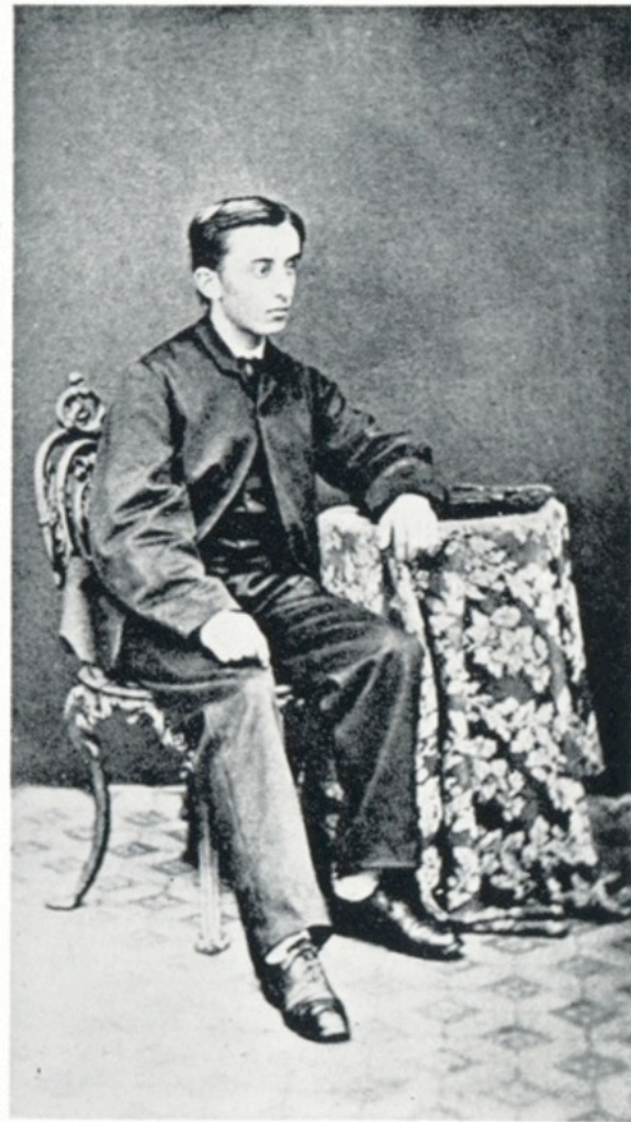
Hearn at 16

But it was with just such a family that Hearn found himself fettered late in his life. This Poe-faced outsider and aficionado of the eerie and the bizarre, who any number of times had been bereft of the barest means of subsistence, living off the smell of an oily rag in London, sleeping rough and wandering the streets of the Rue Morgue in Cincinnati and New Orleans, was to be earning a formidable salary as a teacher in Japan while supporting up to 11 people, including wife, four children, in-laws and servants. He published on average a book for every year he lived in Japan and was read eagerly not only by Americans for his esoteric insights into Japanese mores, traditions and passing lifestyle, but also by readers in China, India and Europe, though not Japan.