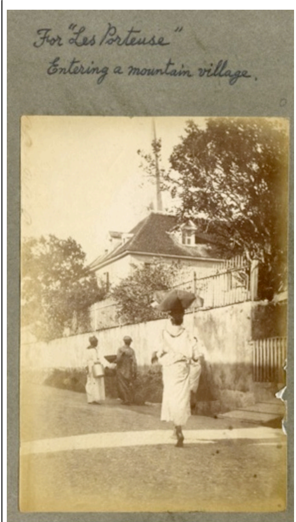
Hearn's photograph of Martinique

Had he lived another two or three decades, he would have been appalled at the manner in which the self-aggrandizing powerbrokers in the cultural establishment of Japan used him for the purposes of justifying incursions into Asia. He loathed the modern Japanese male and what he stood for, and in this he recognized the futility of his task, a futility keenly felt toward the end of his years, where he heard “nothing but soldiers and the noise of bugles.”