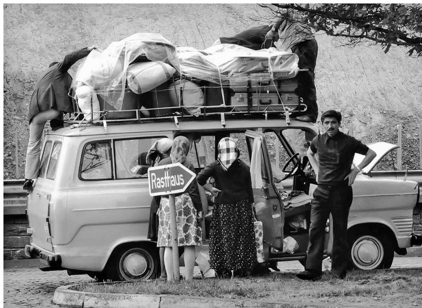
FIGURE 2.5 Turkish vacationers at a rest stop on the E-5 in Austria, ca. 1970. Their car, an iconic Ford Transit, is loaded to the brim with consumer goods, including a rooftop luggage rack.

workers deliberately opted for cars that could hold not only large quantities of luggage but also large families. The Ford Transit, a sturdy and spacious minibus first produced in 1965, became such an iconic symbol of the guest worker program that the German city of Bremen erected a statue of it in 2017 (Figure 2.5). 97