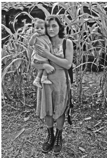
Figure 8.4 The scorched-earth ferocity of Central America's civil wars affected rural peoples and food production. In this image from 1983, a young woman with the insurgency poses with child and assault rifle in front of maize in Guazapa, El Salvador, a region targeted by the Salvadoran army.

from the repressive army forces. Farm fields became battlegrounds, displacing hundreds of thousands of peasants. According to the United Nations Refugee Agency, conflict expelled roughly 20 percent of El Salvador's population, while other estimates indicate that 14 percent of the population in Guatemala and Nicaragua fled from their countries. 71 Some studies estimate that a total of around 2 million