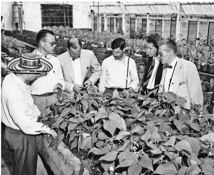
Figure 8.1 Beans featured among the objects of research and breeding at the Rockefeller Foundation's agricultural program in Colombia. Here a small group considers beans growing in the greenhouse, ca. 1954.

Between its creation and the 1980s, CIAT developed six broad programs encompassing plant-breeding research and training. The rice program, launched in 1967, took advantage of an alliance with IRRI in the Philippines and ICA in Colombia. 8 On the one hand, cooperation with IRRI turned CIAT into a “genetic bridge,” allowing the transcontinental exchange of rice varieties and the introduction of the high-yielding variety IR8 germplasm to Latin America. Following IRRI's experience, the program developed high-yield varieties suited for irrigated rice, and created an intensive agrochemical package for pest control and plant disease. 9 On the other hand, the association with ICA enabled experimentation and field testing of Asian rice varieties in Colombia and