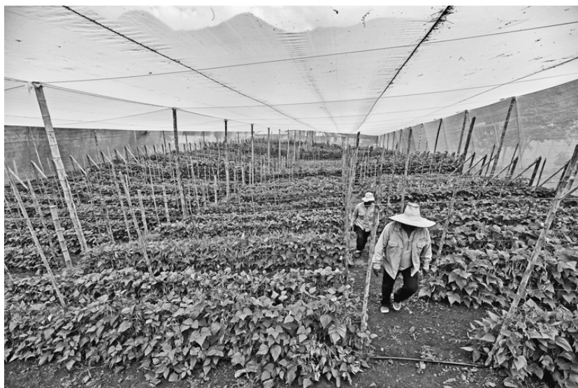
Figure 8.2 The bean collections established earlier in CIAT's history continue. Today, maintaining CIAT's collections of bean germplasm involves the multiplications of seeds in screenhouses in Colombia's Central Cordillera, 2017.

In 1978, CIAT appointed a permanent resident scientist to Central America to improve coordination with national bean programs. 45 This step set the foundation of PROFRIJOL. During its first two years, the project received funding from the United Nations Development Programme (UNDP); afterwards, in the 1980s, the Swiss Agency for Development and Cooperation (SDC) provided funds. 46