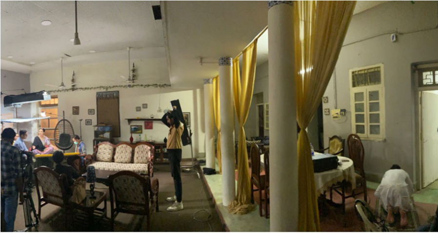
Figure 2. Reading namaz on set (lower right of image).

The more comfortably class-positioned cast members spoke openly and often of their socializing habits (e.g., sports, going out, parties, and video games), rarely including religious activities. By contrast, one of the spot boys (the terming itself points to the relative position of this crew member to others) approached me to ask a question about my religious practices. Moin hesitatingly asked, pointing to my aqeeq , the silver ring with an agate stone on my right hand, “Do you remove it in the washroom?” At first, I was taken aback by the personal nature of the question. I quickly contextualized it as following my steering of that day’s lunch conversation to the subject of religion in dramas. The question also spoke to the crew’s interest in my religious practice as a convert from North America and that I situated a study of Islam in Pakistan within the framework of dramas (of all things!).