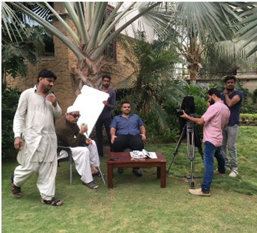
Figure 1. On the set of Biwi Se Biwi Tak (2018).

practice come together. Amidst these elements, what interests me are the negotiations in the filming of pious shots.