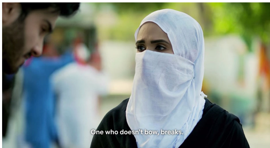
Figure 12. Mystery niqabi comes to drive home the point.

God. In the following scene, a woman in a white niqab comes into the scene, comes up to him, and says, “ Joh murte nahin hain, woh tut jate hain ” (Figure 12), an exchange with multiple valences implying both the character’s stubbornness and the act of prostrating before God. 43