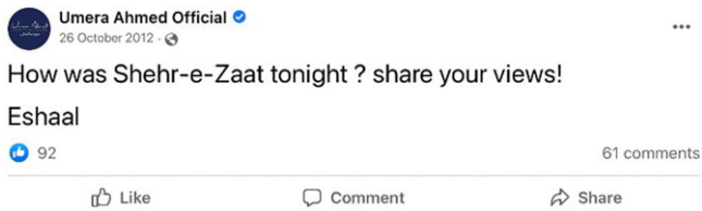
Figure 9. Umera Ahmed Official Facebook Page manager calls for audience members to share their thoughts on that night's episode.