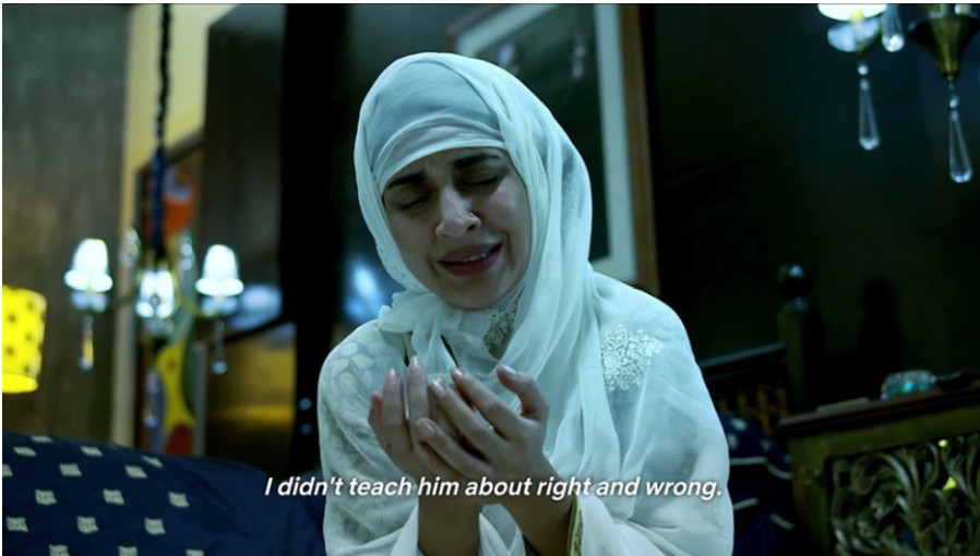
Figure 13. Mir Hadi's mother laments her poor mothering while supplicating.

The narrative employs Mir Hadi's and Khaani's mothers to further visualize distinctions around pious and worldly preoccupations by placing the two characters in contrasting prayer scenes. These visual strategies make the drama genre firmly anchored to the family by stressing the centrality of the family unit as the site for producing and preserving pious habitus. These televisual images also contribute to the metapragmatics of visualizing correct forms of prayer and piety and locating the religious self in the world.