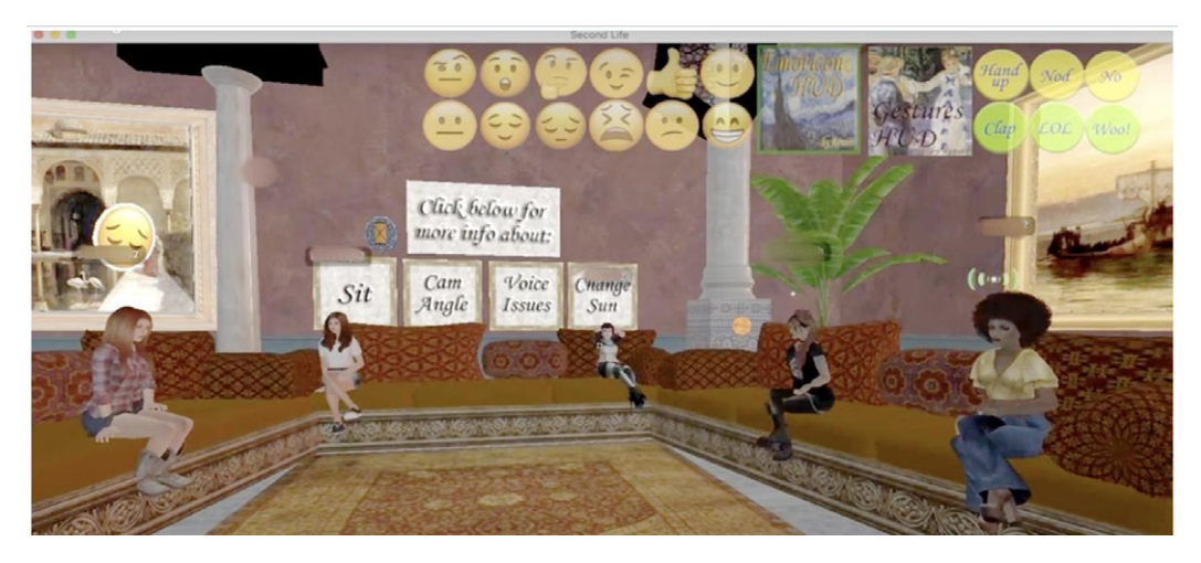
Figure 2. A screenshot of Task 2 in Second Life