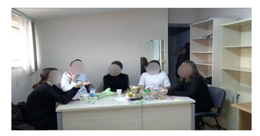
Figure 3. A screenshot of Task 3 in F2F environment