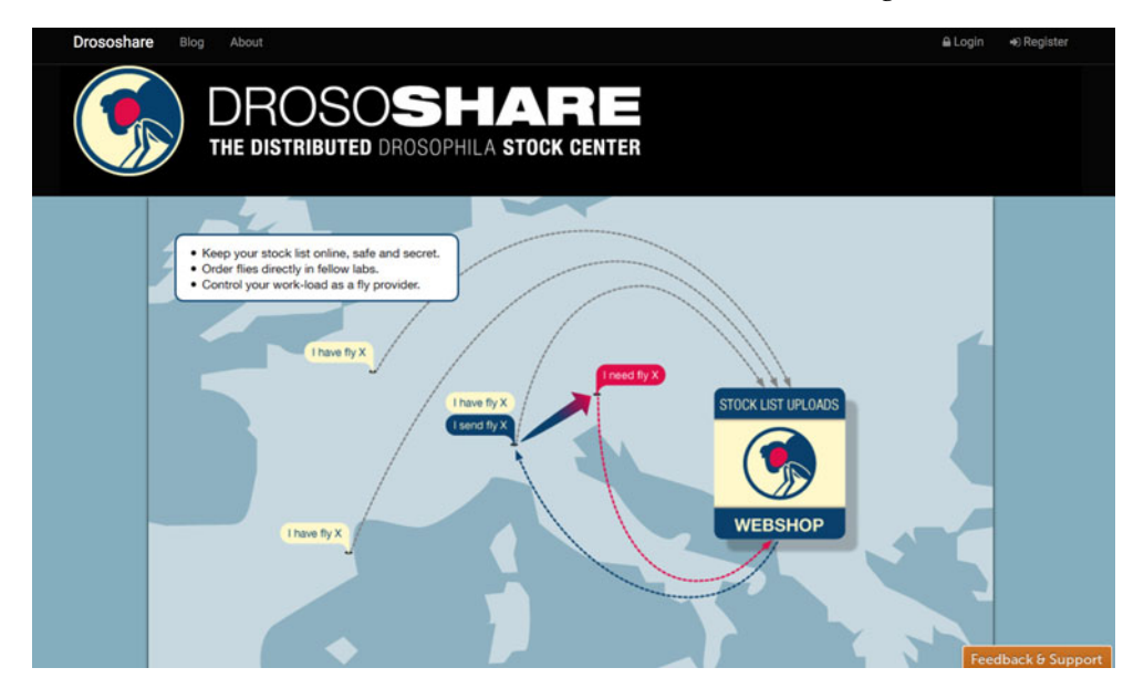
Figure 3. A screenshot of the Drososhare landing page. Logo and design by Daniel Wagner in collaboration with Julien Columb (www.drososhare.net, accessed 5 August 2017). Reproduced under CC BY 4.0, http://doi.org/10.5281/zenodo.3373817..

lists for the efficient circulation of flies. Another was that Drososhare might circulate flies derived from lines otherwise kept at stock centres, thereby potentially depriving those stock centres of income (in some ways analogous to the potential threats to hotels and taxi services posed by organizations like AirBnB and Uber). The Drososhare initiative certainly had the potential to facilitate the circulation of flies, and to alter the range and representation of stocks in labs and stock centres, but some believed it also threatened the continued existence of stock centres in and of themselves.