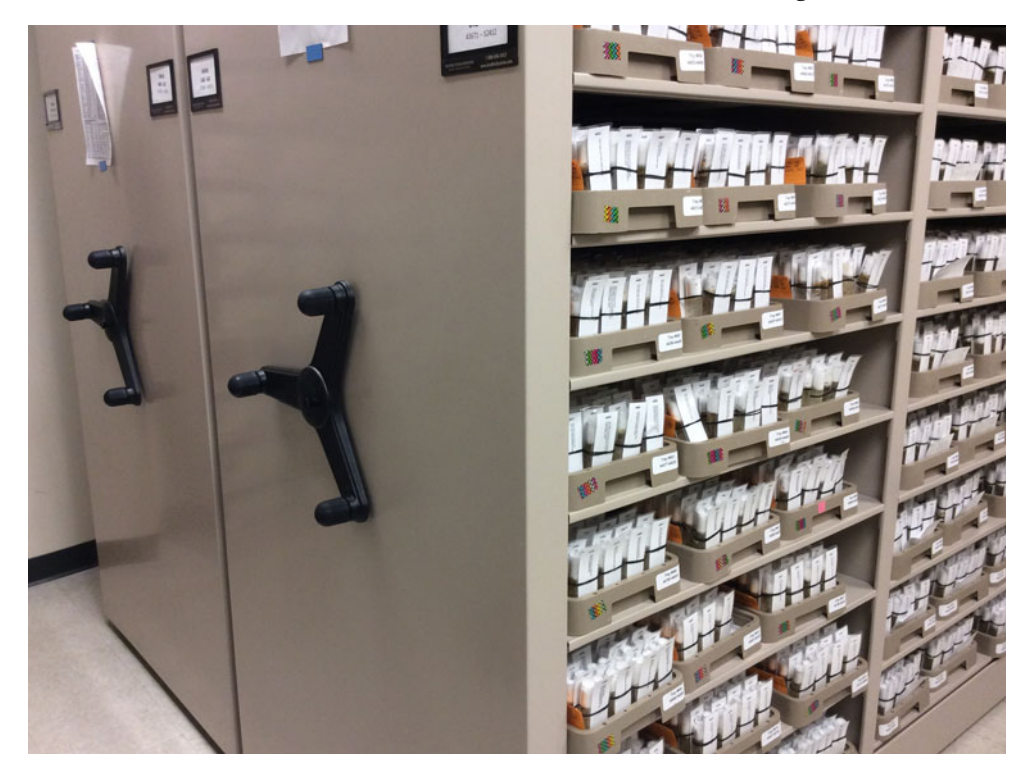
Figure 2. The main storage room for the BDSC Drosophila collection, with moveable library shelving. One collections manager remarked that some of the stock keepers chose to make their stocks look 'more distinctive' by decorating their trays with coloured labels and tape.

Altogether the BDSC holds about 300,000 active cultures, the day-to-day care of which falls to fifty-five or so stock keepers, who 'flip' the vials onto new food every two weeks. A cook prepares fly food in a dedicated kitchen, equipped with restaurantgrade stainless steel cooking utensils. D. melanogaster cultivation is relatively flexible – stock keepers are free to flip their vials at any time, day or night (one person I spoke to routinely arrived at 4 a.m. and left by 11 a.m.). Most of the stock keepers work part-time (the team of fifty-five corresponds to twenty-two 'full-time equivalents'), and most are women.<sup>30</sup> One former (female) stock keeper remarked that the 'best workers' were mothers, who typically arrived early, carried out their stock-keeping work, and then left to take care of their children – the rhythms of fly keeping making it possible to dovetail two kinds of reproductive labour. Each stock keeper looks after a stable subset of flies and has their own trays of stocks, and full-time workers flip on