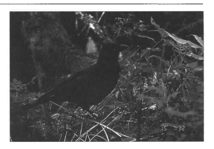
Young hand-reared alala Corvus hawaiiensis on the forest floor at the release site ( Peter Harrity ).

The birds are considered to be independent of the release process at approximately 250 days old when supplementary feeding is discontinued and they start to disperse. Monitoring and tracking of independent alala is supervised by NBS and Service biologists.