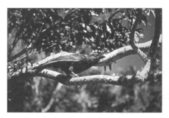
Young hand-reared alala Corvus hawaiiensis perching on native koa Acacia koa shortly after release.