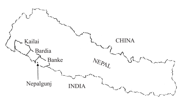
Fig. 1. Map of the study area, Banke, Bradia and Kailai districts were selected for the study. The study base was set at Nepalgunj, the largest city in the western part of Nepal.

Information on JE cases was collected in the three epidemic districts, Banke, Bardia and Kailali in 1997. The study base was set at Nepalgunj, the largest city in the western part of Nepal. Six health facilities were involved in the study, and a total of 1819 recorded JE cases were reviewed. Hospital records contained age, sex, admission and discharged dates, and address of patients. According to the physicians in the hospitals, JE cases were diagnosed according to the criteria: (1) clinical symptoms including high fever, altered sensory, neck rigidity and unconsciousness, (2) exclusion of malaria, bacterial meningitis and typhoid fever through the microscopic observation of thick blood film, CSF test and Wider test and (3) follow up for