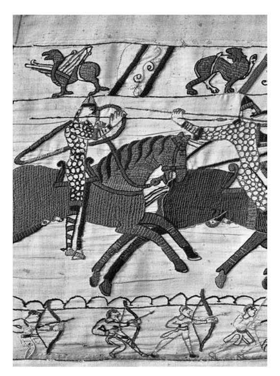
Fig 5. Detail of the Bayeux Tapestry showing the part from where the tapestry fragment was removed.