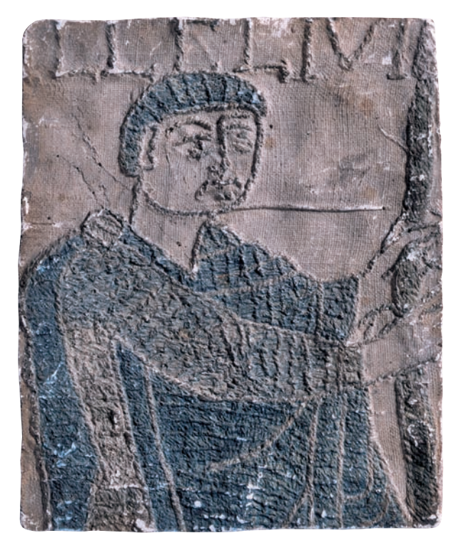
Fig 3. Plaster cast of detail of the Bayeux Tapestry.