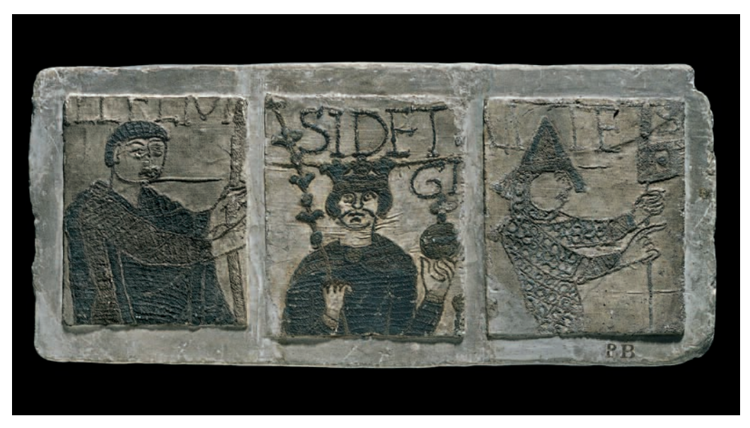
Fig 2. Plaster casts of details of the Bayeux Tapestry.