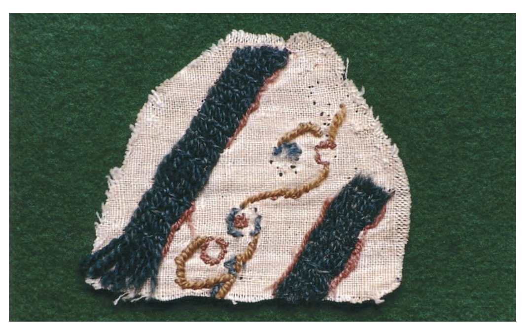
Fig 4. The fragment of the Bayeux Tapestry removed in about 1816.