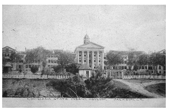
FIG 2 East Louisiana State Hospital, formerly Louisiana State Insane Asylum.