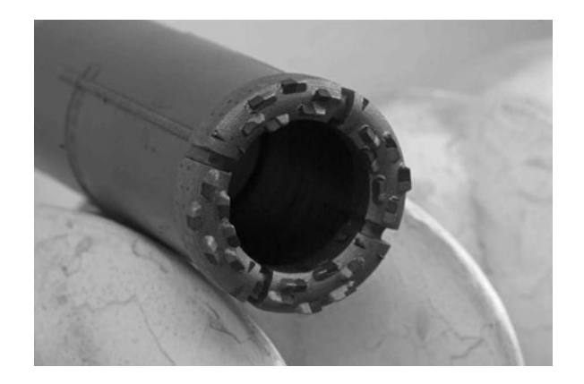
Fig. 5. Temperature-stabilized diamond rock-coring bit.