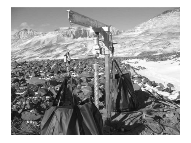
Fig. 1. Koci drill rig in Beacon Valley.

three cutters (Fig. 2) because we believe a three-cutter drill runs more smoothly and is more stable in the hole than a two-cutter drill. We have also found it easier to start a new hole with a three-cutter drill. The drill cuts a thin kerf in order to minimize the force required to penetrate rock when using the rock-coring bits.