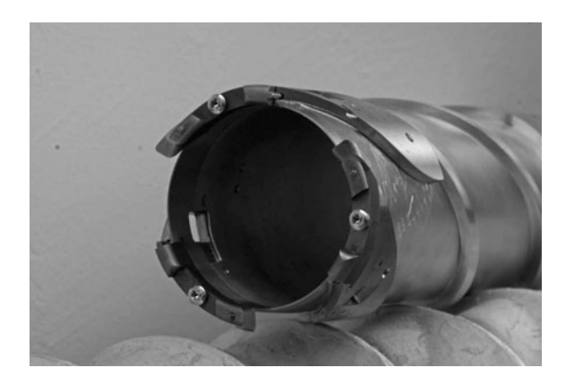
Fig. 2. Koci drill 3 cutter core head.

Both types of inserts have rounded corners, a relief angle of 15° on the core side of the cutter and no relief on the bore wall side. They are held in place by a countersunk sockethead Torx<sup>TM</sup> drive set screw. The cutting pitch is controlled