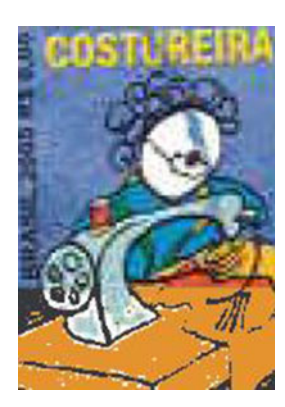
Fig. 2. Brazilian stamp.

on it (one of which most appropriately showed a very curly haired Costureira; see Figure 2). The letter was written in 20-pt font (mostly in caps) which included the very memorable line 'I AM A DEALER IN BRAZIL', a request for exclusivity and an intriguing question about whether the pills were for ETERNAL use.