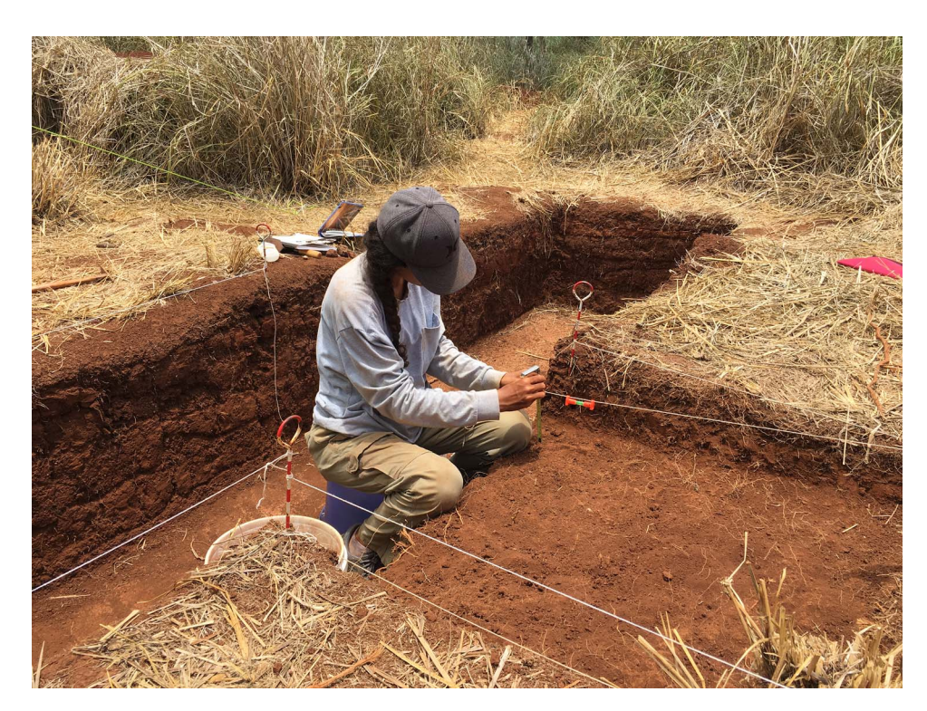
FIGURE 4. Student of the 2019 field school at the excavation of Feature I-7, a possible prisoners of war mess hall platform (concrete).