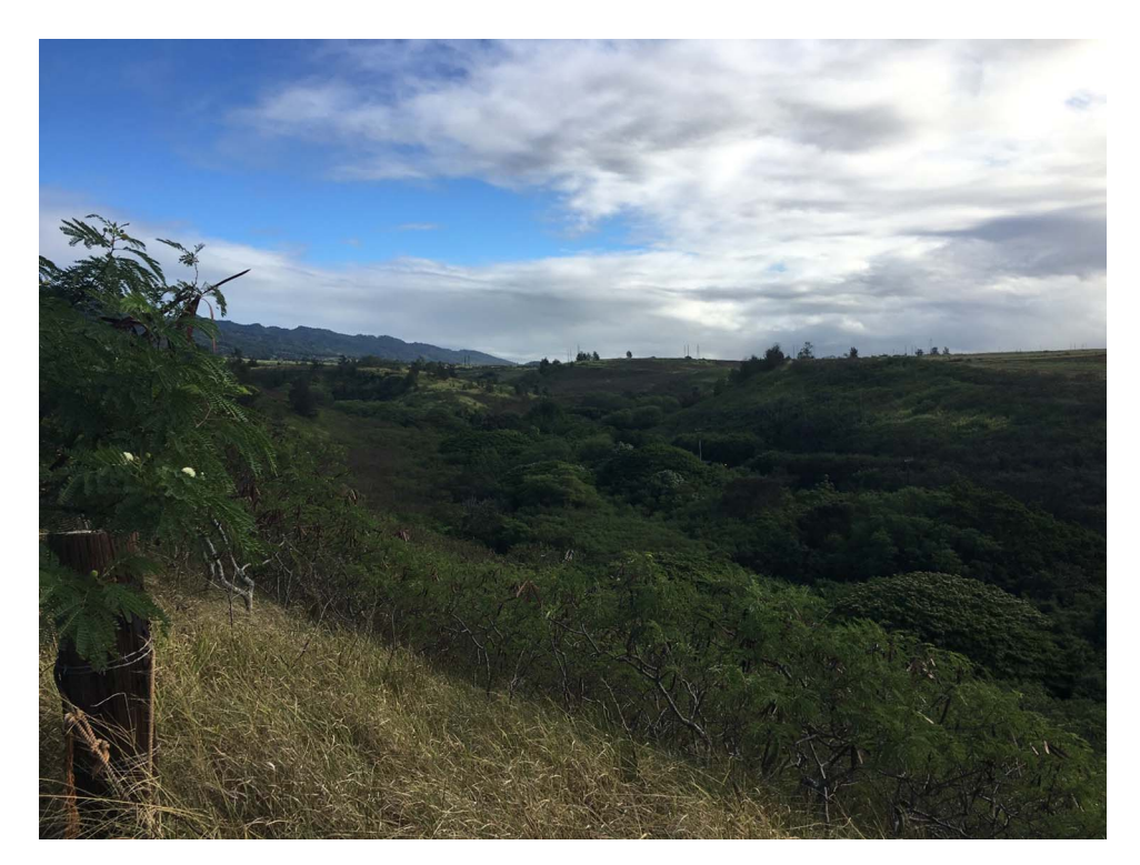
FIGURE 1. Overview of the Honouliuli National Historic Site, facing north. This is almost the same viewpoint as in Figure 3.

access to agricultural lands and resources from several ecosystems. Honouliuli is Hawaiian for "dark bay" or "blue harbor," referring to the seaward portion of this ahupua'a. Honouliuli is one of 13 divisions of the moku (district) of Ewa, which includes the entire watershed from Honouliuli Gulch to Kaihuopala'ai (West Loch, Pearl Harbor). Local traditions clearly associated the fishponds of Kaihuopala'ai and mullet aquaculture as well as kalo (taro) production with this ahupuàa (Cordy 2002; Kane 2011:175-184). Although we recognize the ancient Hawaiian subdivision of this ahupuàa, no definitive ancient or Native Hawaiian features or sites have yet been located within the property of the Honouliuli NHS (Basham 2014; Burton et al. 2014).