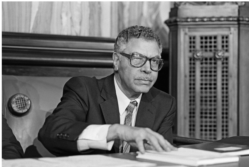
FIGURE 6.2 As Executive Director of the United Nations Environment Programme from 1975 to 1992, the Egyptian scientist Mostafa Tolba played a key role in the promotion of the science and politics of ozone and climate, including the 1985 Vienna Convention for the Protection of the Ozone Layer and the establishment of the Intergovernmental Panel on Climate Change in 1988.