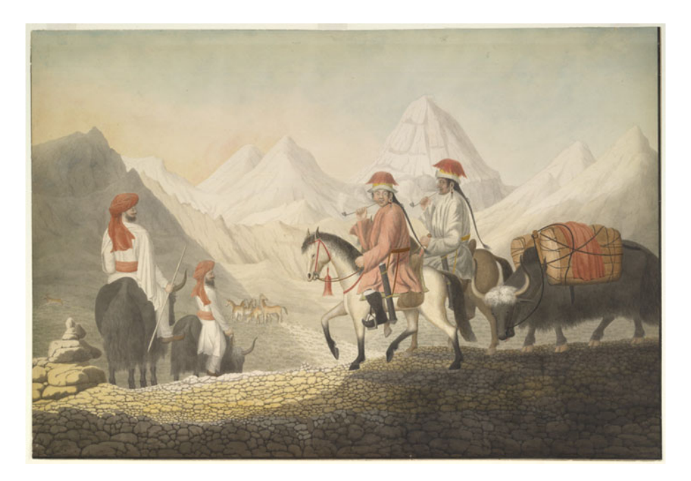
Figure 1. "Kylass Mt. Road to Mansarowar Lake. Mr Moorcroft and Capt. H. and Chinese Horsemen" (1812). Watercolour by Hyder Young Hearsey (1782–1840) of himself and William Moorcroft (1767–1825) in disguise while trying to penetrate the frontier with Tibet.

seemed to fly with just as much ease as at the level of the sea."<sup>44</sup> He also thought it "very remarkable" to find fish in mountain streams as high as 15,500 feet.<sup>45</sup> Attempts to delineate altitude sickness as a scientific phenomenon thus required accounting for the bodies of both humans and nonhumans. That both suffered peculiar debilitations at altitude ultimately strengthened the case for considering uplands as medically distinctive environments, even as it added to the "friction of terrain" circumscribing movement and imperial control in high places.