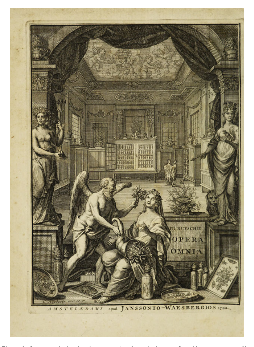
Figure 1. Specimens displayed in glass jars, in glass-fronted cabinets in Ruysch's representation of his house museum.