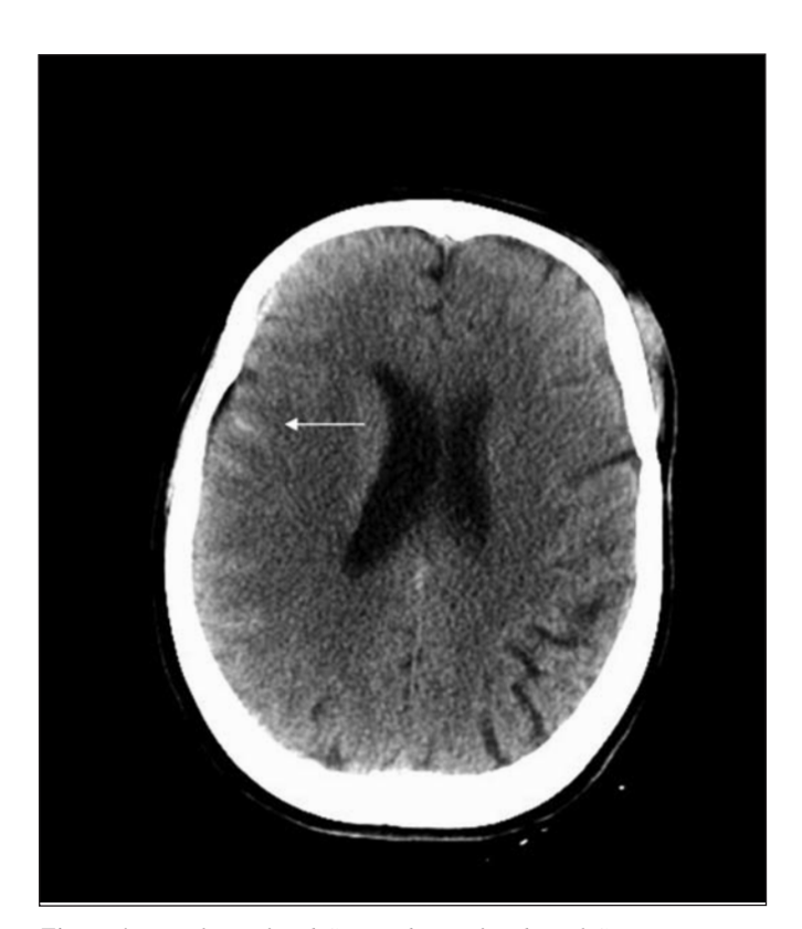
Figure 1: Initial Uninfused CT Head. Uninfused axial CT scan image at time of admission showing a small right lateral cortex hyperdensity, (arrow) consistent with suspected traumatic subarachnoid hemorrhage

A diagnosis of lithium induced diabetes insipidus was made and she was transferred to the Surgical ICU, where her serum sodium was carefully corrected over the next week. DDAVP was administered; however, there was no reduction in urine output or osmolality, indicating a nephrogenic source for the diabetes isipidus. With eventual normalization of all serum and urine output, her neurological status returned to her pre-accident baseline.