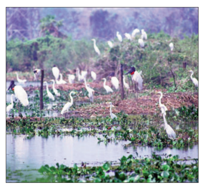
Figure 5: A marsh alongside the Paraguay River with egrets, spoonbills, ibises and Maribu storks all resting quietly. Our host's pistol shot raised a veritable cloud of marsh birds.