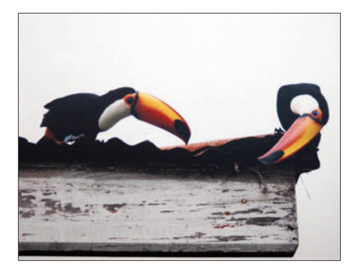
Figure 1: Two chestnut-mandible toucans picking insects under the shingles of an old shed at Iquitos, Peru.

With a 50 horse-power US built outboard attached to a big dug-out canoe, our guide took us down river to two ports of call. The first was a pre-arranged rendezvous with several male members of a jungle tribe each wearing straw skirts and each carrying a blow-gun. They demonstrated their ability to use their implements to kill parrots in a flock near the top of a forest giant. This contrived visit to a primitive tribe was rewarded by Schmitt