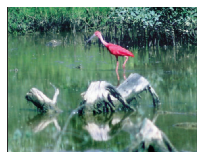
Figure 3: The resplendent scarlet ibis of Tobago.

As part of our "Green-Hell" tour from Manaus we were taken in a dugout up a nearby tributary (the Negro River) to a small lake. The main features were many cayman (freshwater crocodiles) and abundant water-lilies (Victoria lily) with leaves of an average of four feet in diameter (unique in the world for size, not a few reaching six feet in diameter.) They bore easily the weight of a pair of northern jacanas with their three young. (Jacanas are close relatives of our marsh rails but with exceptionally long toes). We fished for piranhas. When hooked